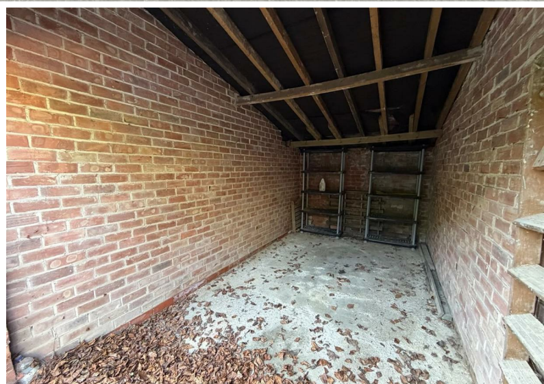
Garage 4 East Lane, New Walk, Beverley, HU17 7AD Offers Over £25,000